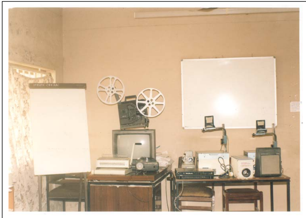
One of the ITC, Audio Visual Laboratories.