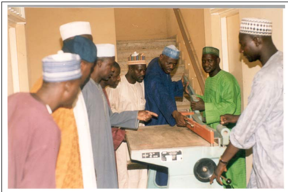
Demonstration Session in Mechanical Workshop

Equipment and tools similar to what is obtainable in industry are available in each of the vocational areas. This offers participants standard training to enable them fit in real life working condition on completion of programme.